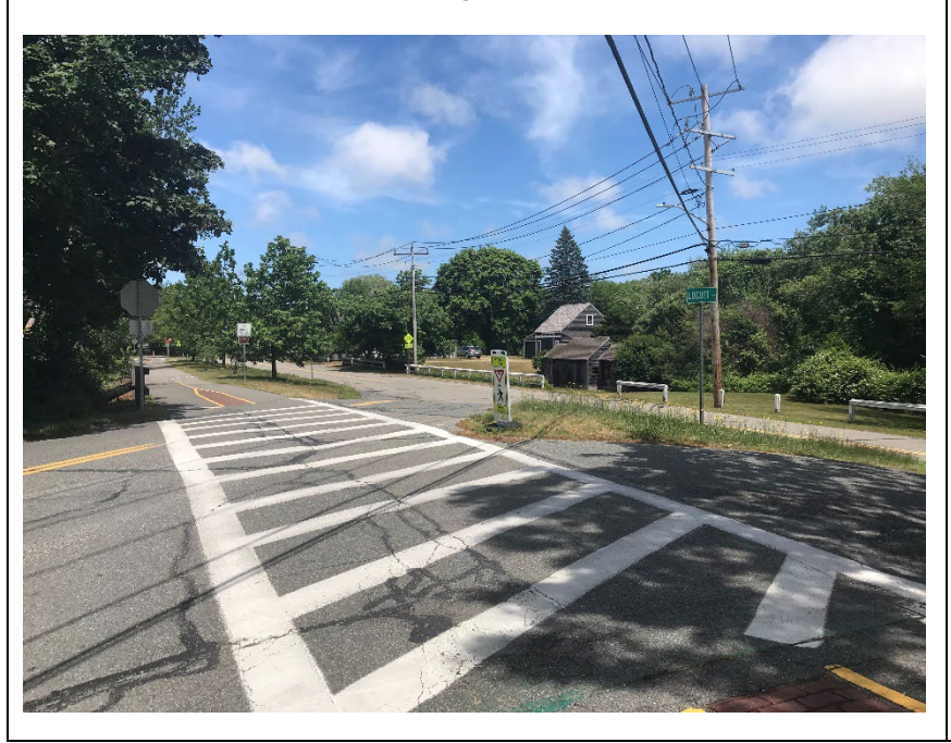
Figure 103: Image of Crossing (Looking Eastward). Note the Ladder Crosswalk and the State Law Yield Sign