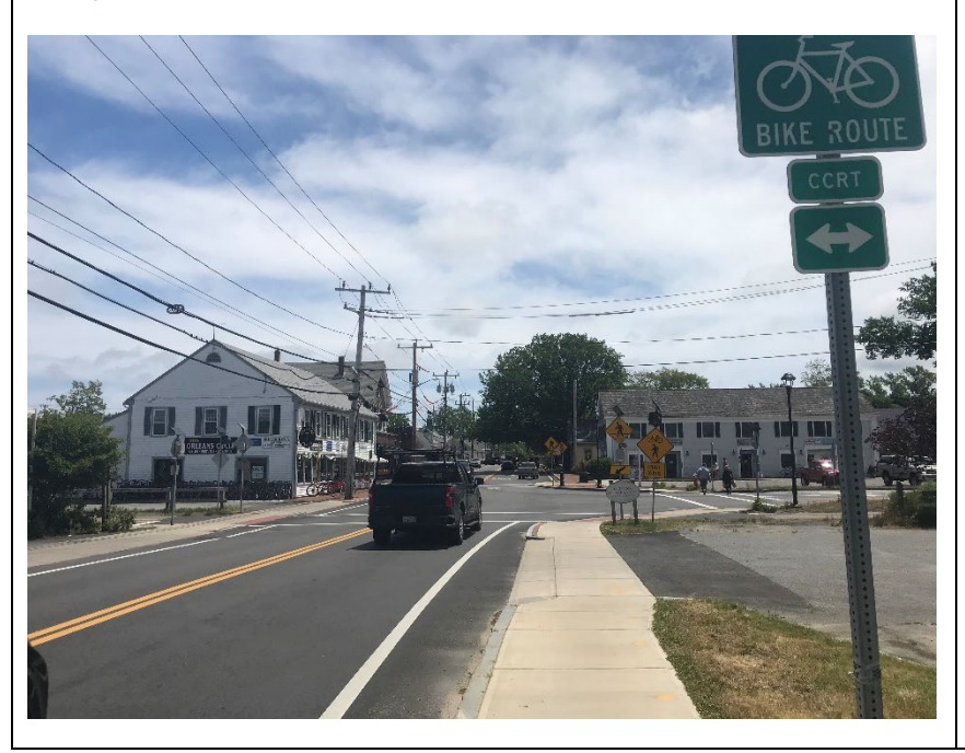
Figure 106: Image of the Flashing STOP Sign at Crossing (Looking Westbound)

Figure 105: Image of Path Crossing from Road (Looking Southward). Note the RRFBs