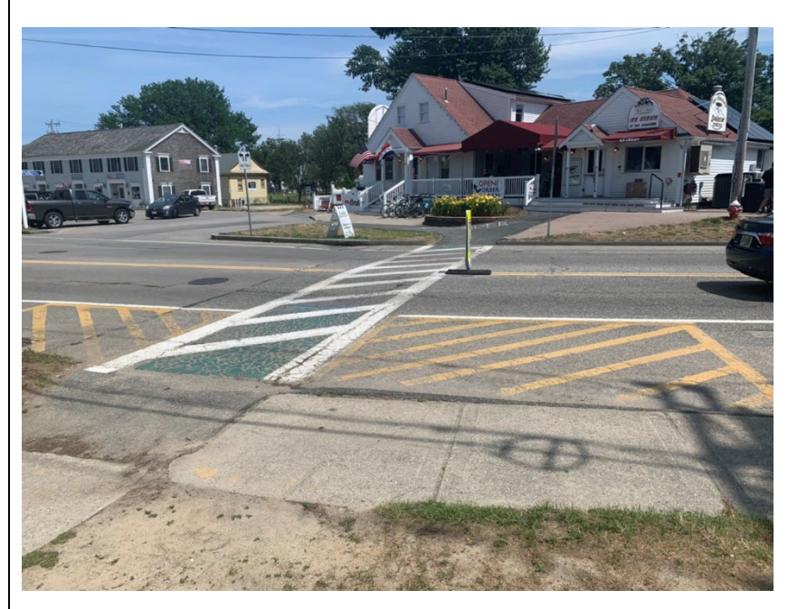
Figure 107: Image of Crossing with State Yield Sign