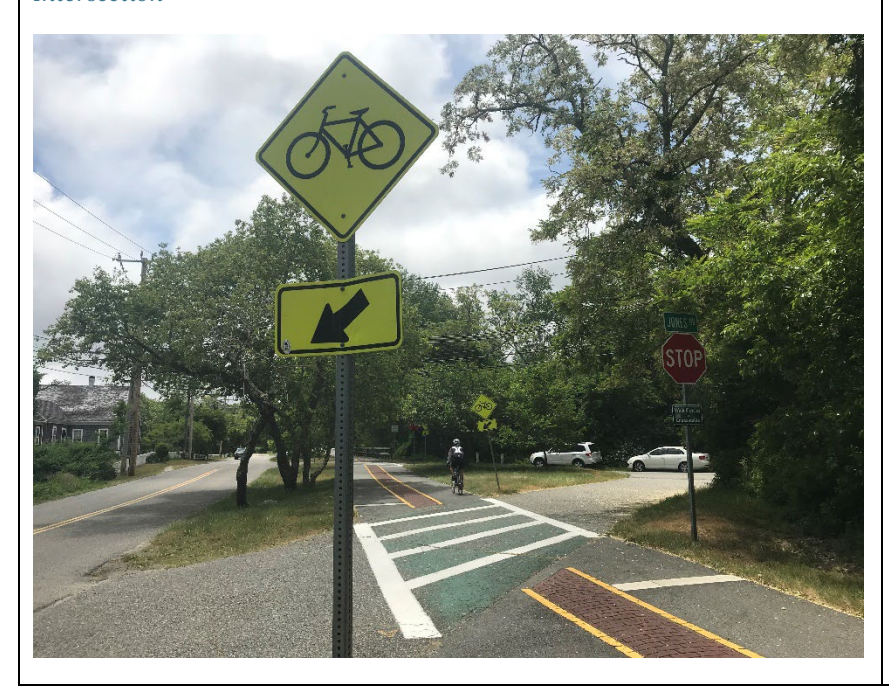
Figure 101: Image of Path Crossing from Canal Road (North Leg of the Y Intersection \,