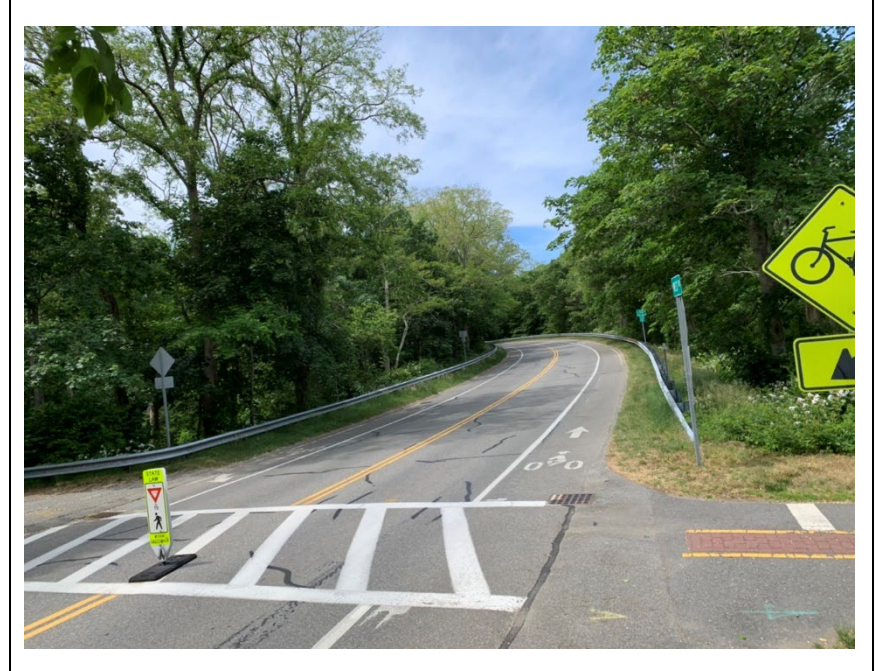
Figure 109: Image of Crossing with State Yield Sign