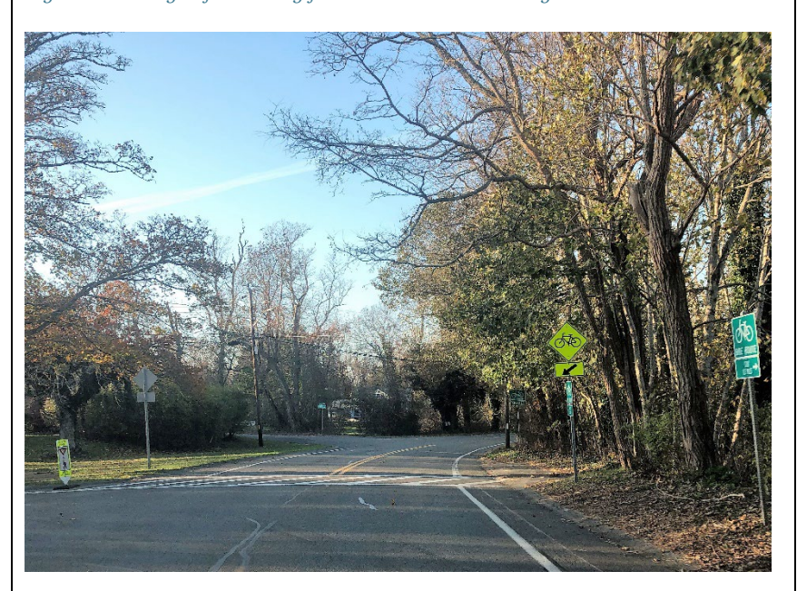
Figure 111: Image of Crossing from West Road heading Southbound